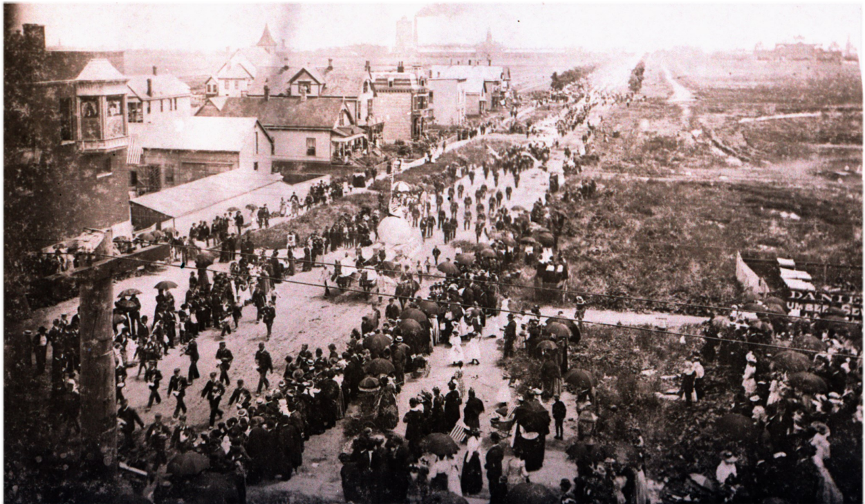
July 4, 1892 Parade

At 9 o'clock p. m., fireworks were exhibited on the meadow west of the Arcade, and were witnessed by the entire populace, and were a success in every way. Some of the pieces were as follows: 1. Welcome; 2. Night falls; 3. Bicycle ride; 4. Mechanical elephant; 5. American eagle; 6. Washington on horseback; 7. African drooping palms; 8. Magic wheel; 9. Wheel of fortune; 10. Go home. Interspersed with extra large batteries, diamond chains, jewel cascade, parachute and calliope, rockets, peacock plumes, prismatic whirlwinds, batteries of colored flowers, and fiery contortionists, electric shower mines, etc. They lasted one hour and a half. In addition to the public fireworks, rockets were sent up from all parts of Pullman, Roseland, and Kensington. At last, tired and surfeited with the day's excitements, old and young, about midnight sought peaceful sleep in homes where quiet reigned.